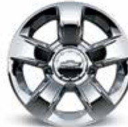
20" Chrome-Aluminum (Available on LTZ)