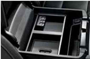
Center Console Organizer