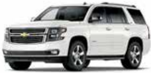
WHITE DIAMOND TRICOAT