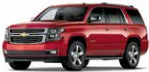
CRYSTAL RED TINTCOAT