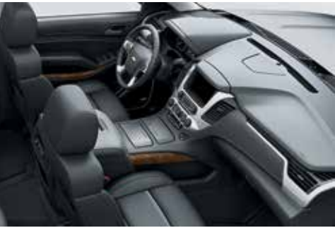
Jet Black Perforated Leather Appointments - LTZ