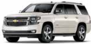
CHAMPAGNE SILVER METALLIC