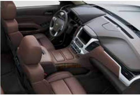
Cocoa/Mahogany Perforated Leather Appointments - LTZ