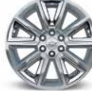
22" Painted-Aluminum with Chrome Inserts (Available on LTZ)

PERSONALIZE YOUR TAHOE. CONTACT YOUR NEAREST CHEVROLET DEALER FOR MORE INFORMATION.