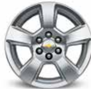
20" Polished-Aluminum (Standard on LTZ; available on LT)