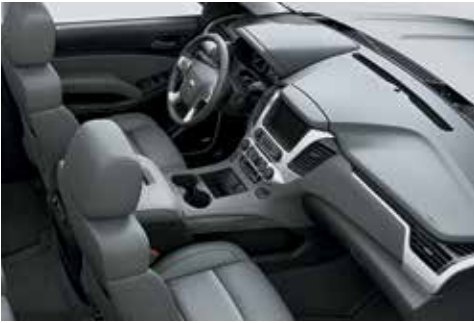
Jet Black/Dark Ash Leather Appointments - LT