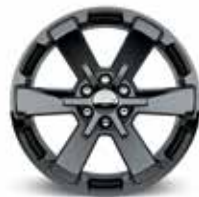
22" 6-Spoke High-Gloss Black Wheel

PERSONALIZE YOUR TAHOE. CONTACT YOUR NEAREST CHEVROLET DEALER FOR MORE INFORMATION.