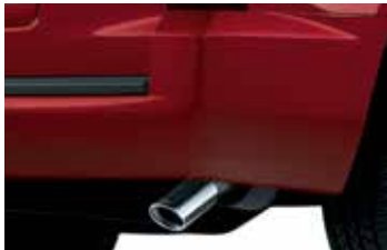
Chrome Exhaust Tip