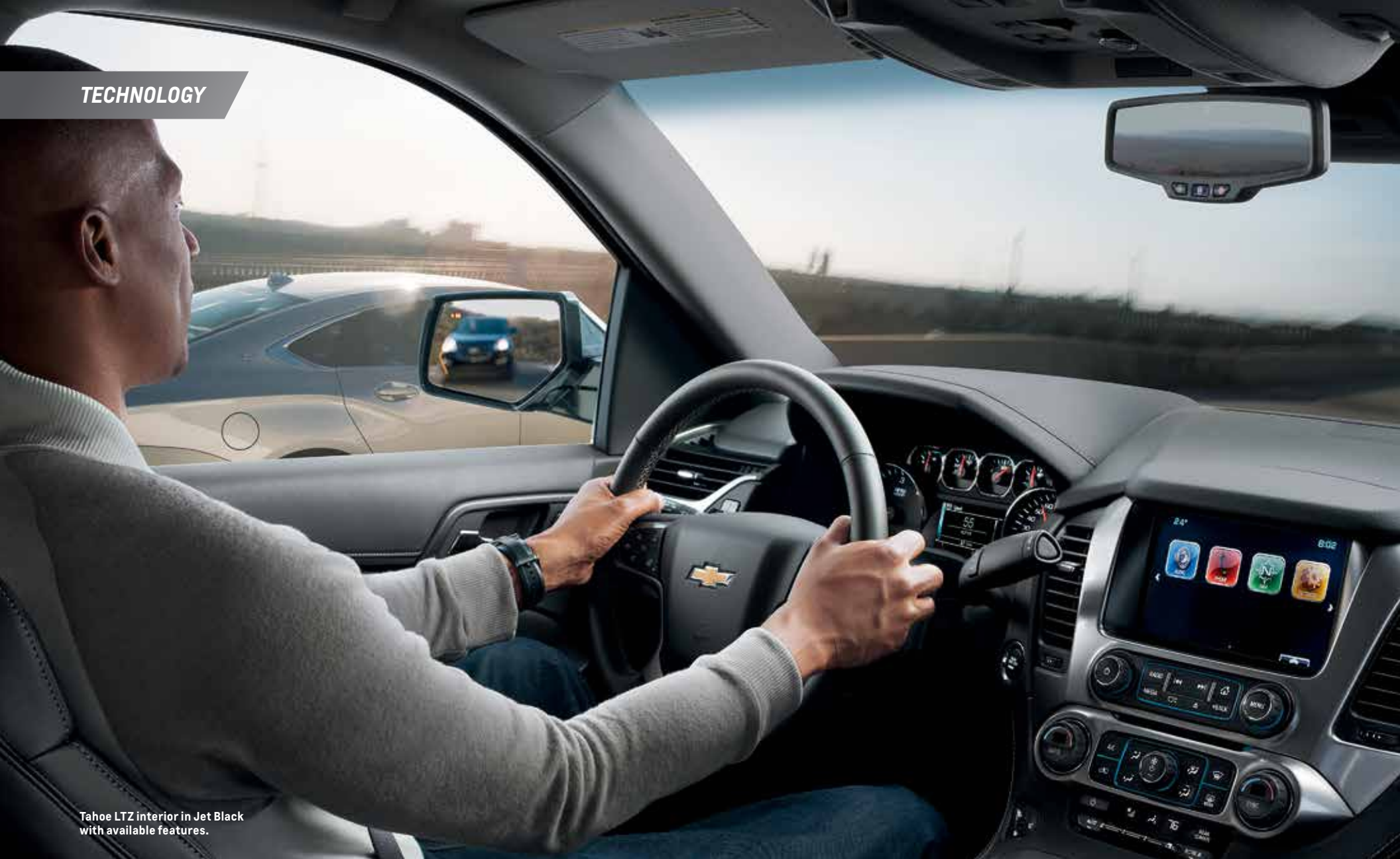
Tahoe LTZ interior in Jet Black with available features.

Available Chevrolet MyLink lets you arrange icons and features on the 8-inch diagonal color touch-screen. Touch and swipe on the screen just like you do on your smartphone or tablet.