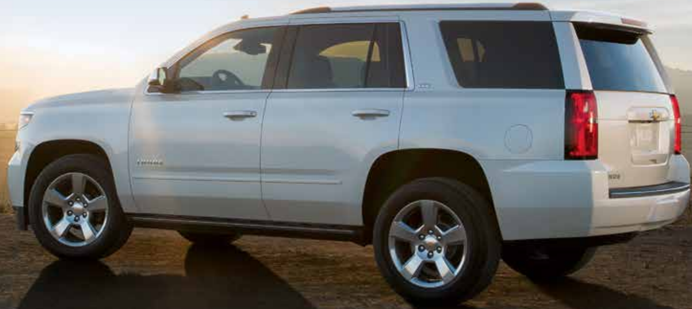
Tahoe LTZ in White Diamond Tricoat with available retractable assist steps (on 2WD only).