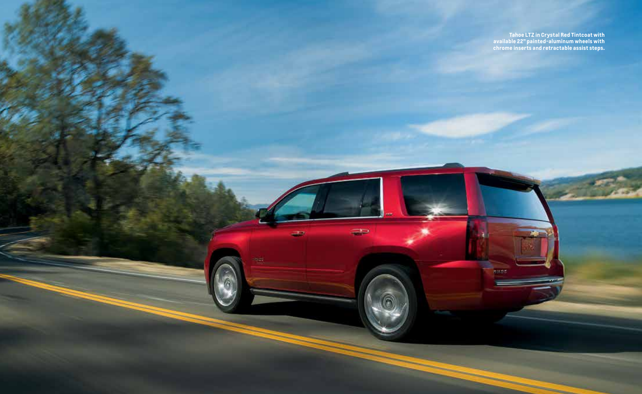
Tahoe LTZ in Crystal Red Tintcoat with available 22" painted-aluminum wheels with chrome inserts and retractable assist steps.

THE ALL-NEW 5.3L ECOTEC3 V8 ENGINE. Direct Injection boosts power and fuel efficiency while reducing emissions. Active Fuel Management™ deactivates four cylinders when extra power is not needed. Variable Valve Timing helps ensure Tahoe performs at optimum power and efficiency. Bottom line? Tahoe offers better fuel economy than any competitor — an EPA-estimated 10.2 L/100km highway on 2WD models!