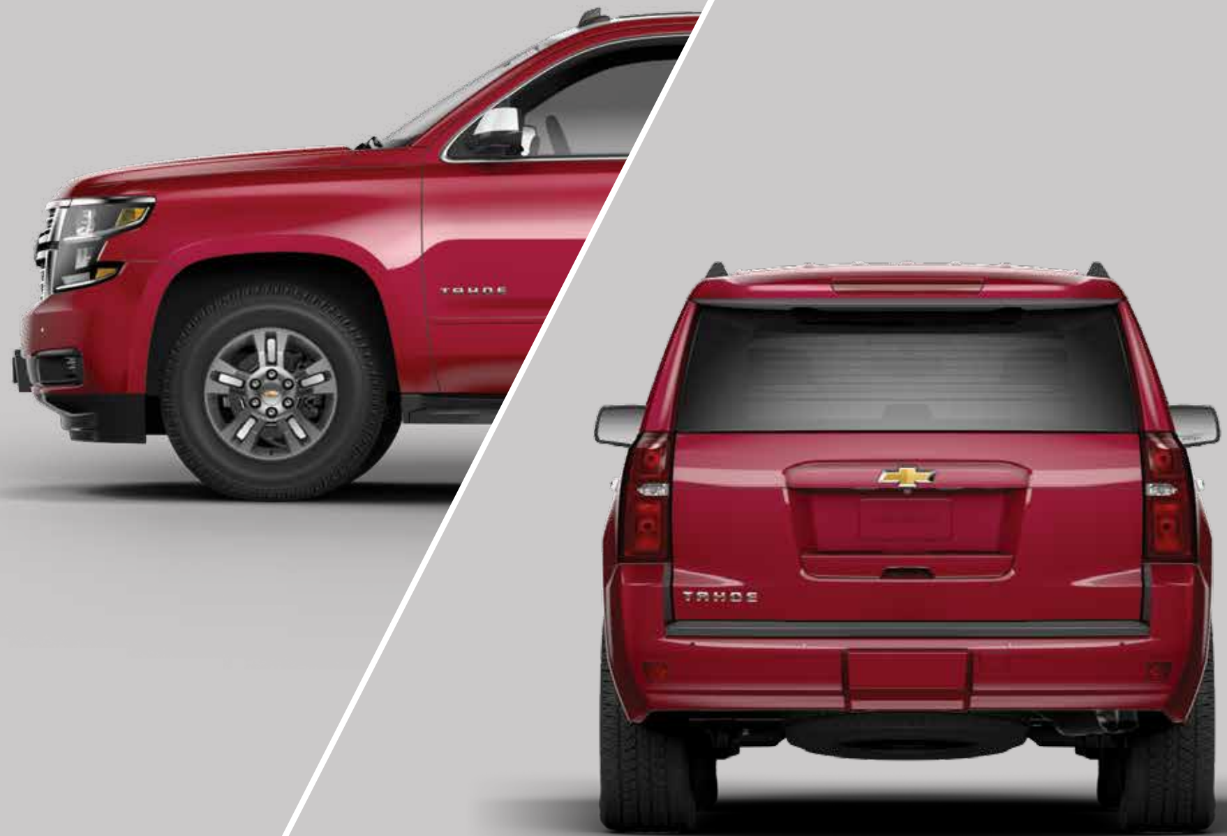
Tahoe 2015 in Crystal Red Tintcoat.