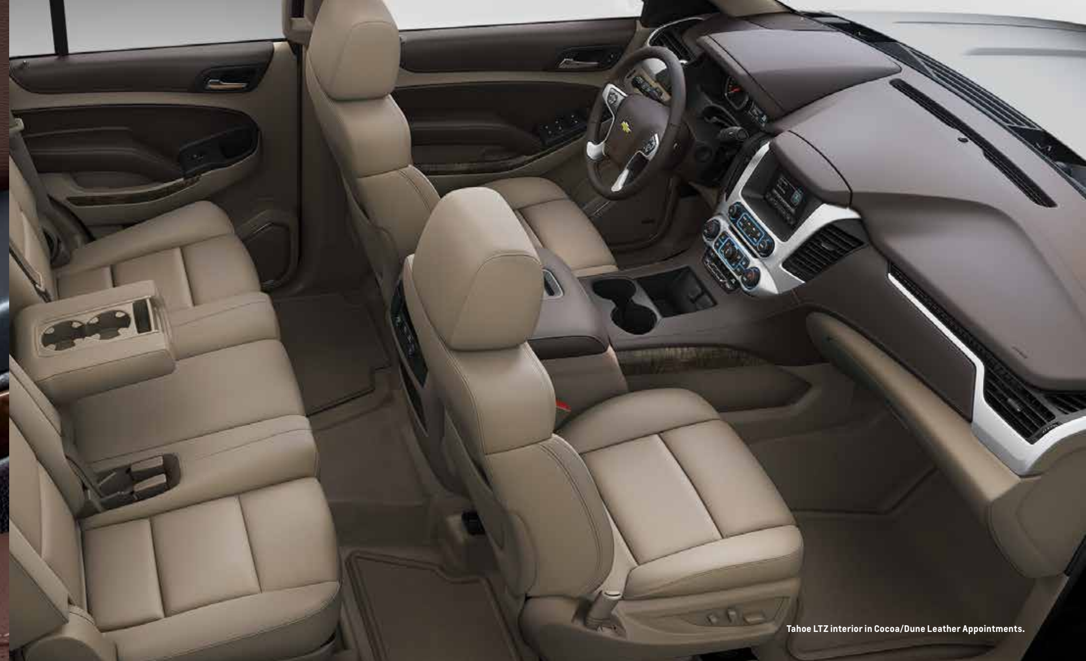
Tahoe LTZ interior in Cocoa/Dune Leather Appointments.

An acoustic-laminated windshield and triple-sealed inlaid doors help create a drive that whispers luxury.