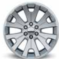
22" 6-Split-Spoke Ultra Bright Machined Monoogian Silver Wheel