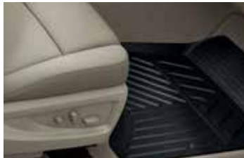
All-Weather Floor Mats