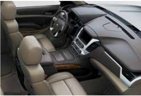
Cocoa/Dune Perforated Leather Appointments - LTZ