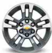
18" Aluminum with High-Polished Finish (Standard on LS and LT)