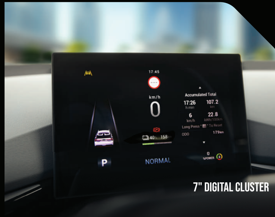
7" DIGITAL CLUSTER

Stay connected on the go with the MG 4 Electric's advanced technology. Features include a Bluetooth key, and a 10.25" touchscreen for seamless integration with your smartphone through Apple CarPlay and Android Auto. The car also has a 360° camera system, providing real-time parking assistance and reducing blind spots for safer manoeuvring. The ADAS display and gear display offer intuitive access to vital driving information. Integrated multi-functions support online services, navigation, music, and weather, keeping you informed and entertained throughout your journey.