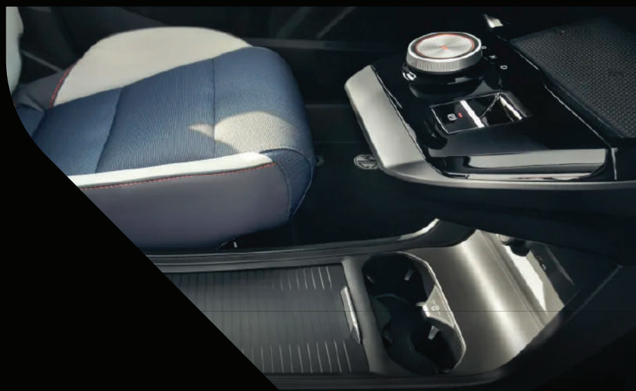
28 GENIUS STORAGE SOLUTIONS