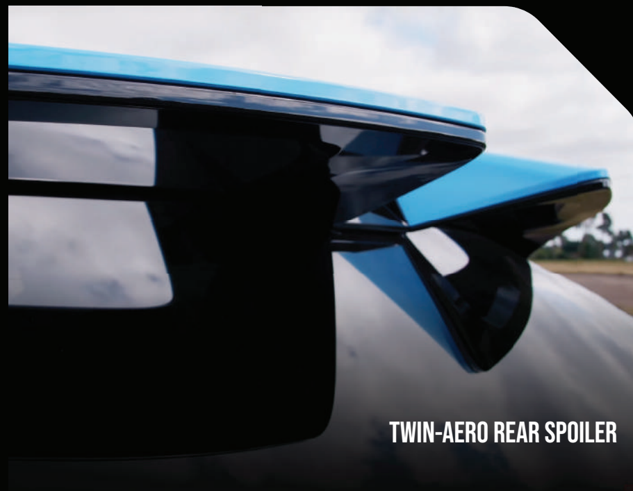
TWIN-AERO REAR SPOILER

The MG 4 Electric features a future-focused design that guides its stunning exterior. Its nimble, flowing two-tone roof adds a layered visual presence, while unique LED headlights and a dual-wing spoiler with high-mounted brake lights enhance its agile appearance. The U-shaped active intake grille not only adds to the sleek design but also improves cooling efficiency. Along with the carbon-fibre effect diffuser and multi-layered rear end, these elements create a bold and dynamic look that turns heads wherever it goes.