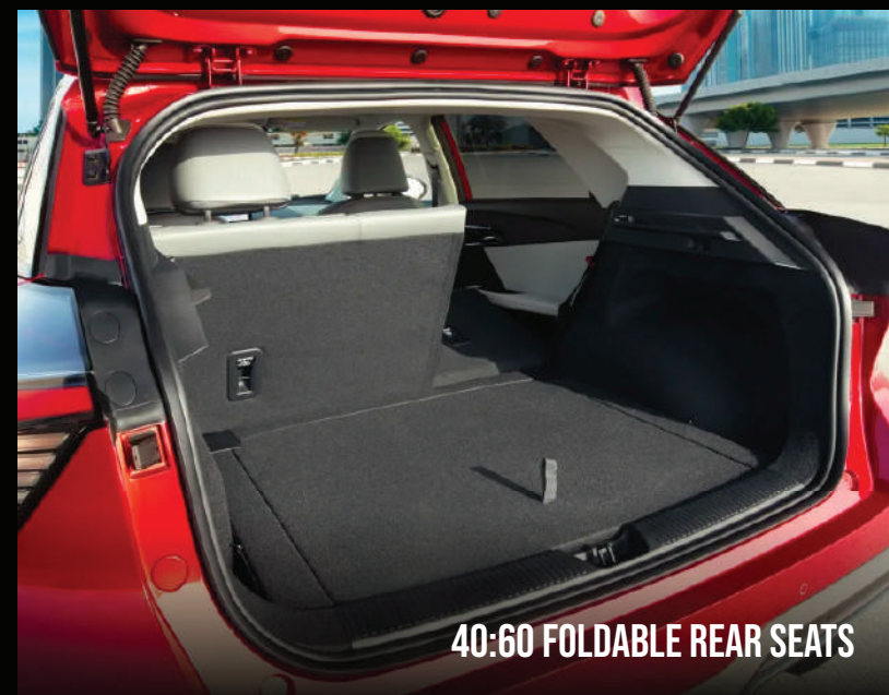
40:60 FOLDABLE REAR SEATS