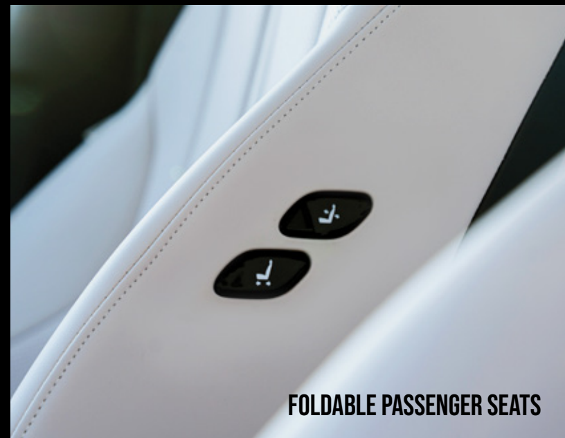
FOLDABLE PASSENGER SEATS