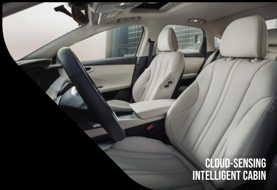
CLOUD-SENSING INTELLIGENT CABIN

Settle into zero-gravity seats, memory-equipped and ventilated for lasting comfort. Expansive legroom opens the cabin; hush when you seek it, or be immersed by an integrated surround system when you choose.