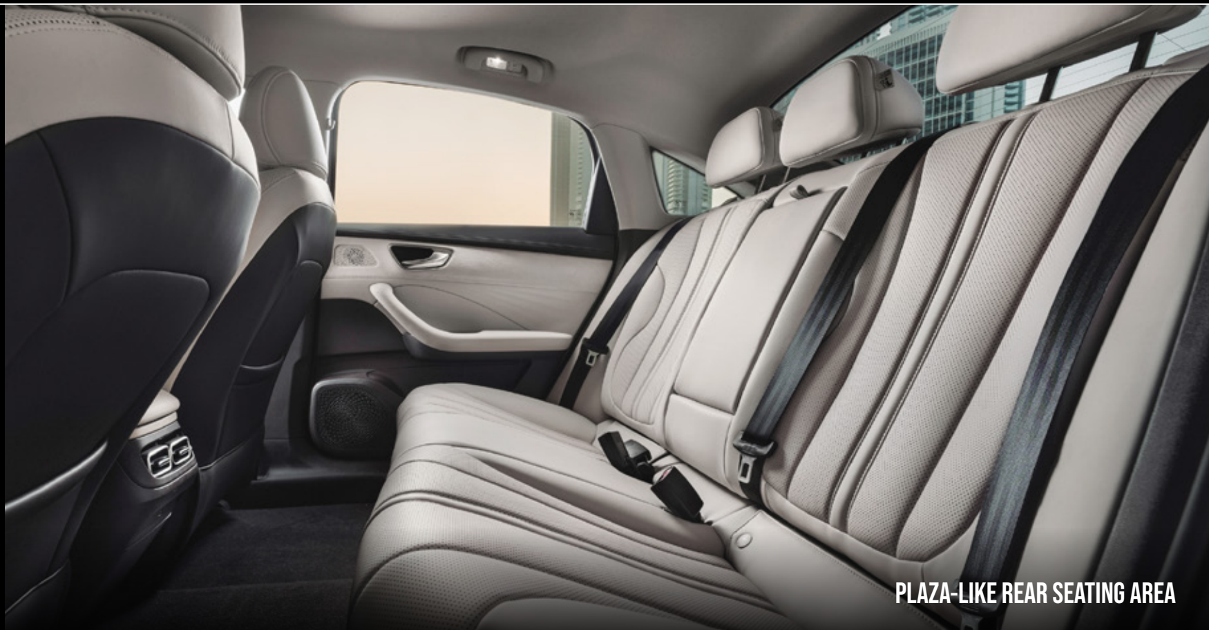
PLAZA-LIKE REAR SEATING AREA