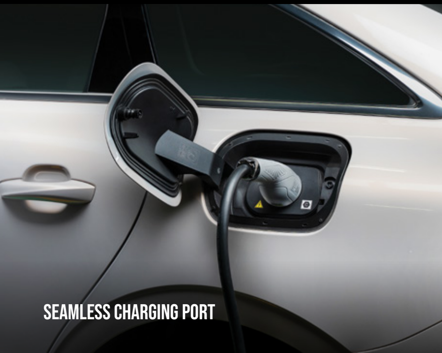
SEAMLESS CHARGING PORT