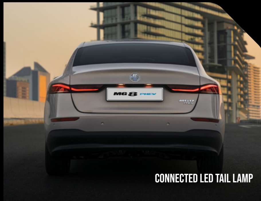
CONNECTED LED TAIL LAMP

With a wheelbase of 2,810 mm and a sleek silhouette, the MG 8 carries the elegance of a coupe within the presence of a sedan. Every detail is deliberate, every line a statement of modern strength.