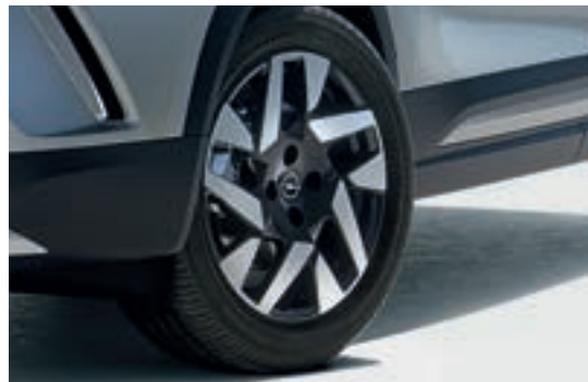
Mokka Edition 17" two-tone black alloy wheels