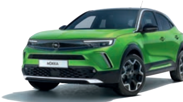
Matcha Green Metallic paint