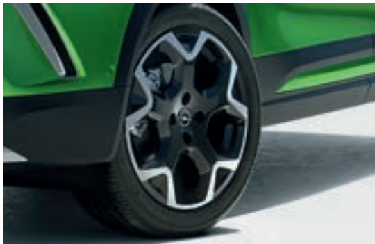
Mokka SRi 18" two-tone alloy wheels with black accent