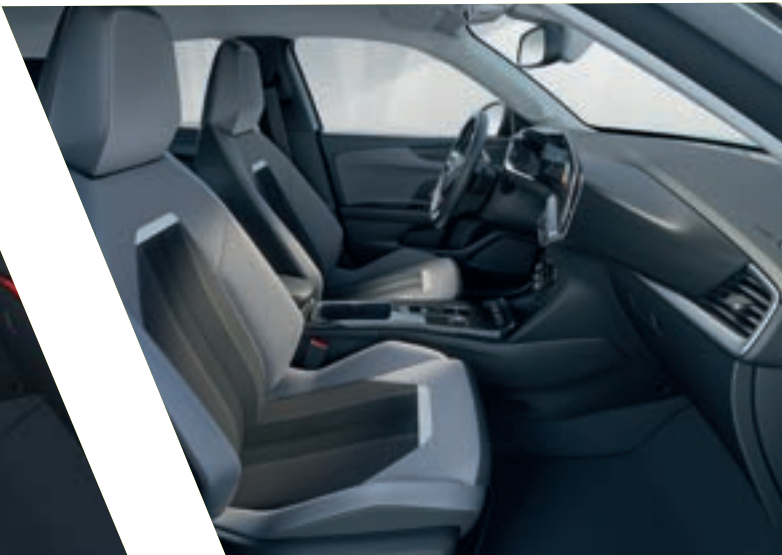
Mokka Edition Grey leatherette & black cloth Silver dashboard trim