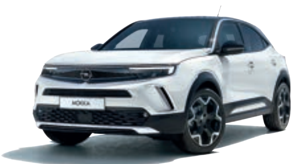
Jade White* Solid paint*