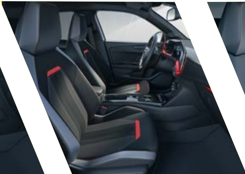
Mokka SRi Black leatherette & cloth with red stitching Red dashboard trim