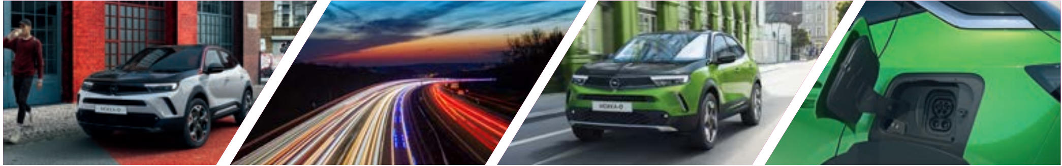
AGILE AND RELIABLE