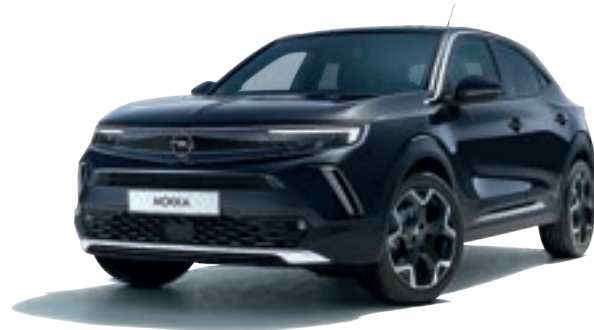
Diamond Black* Metallic paint*