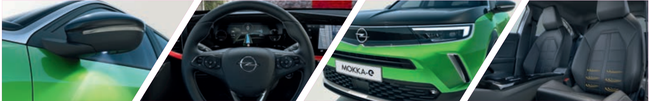
BOLD & PURE DESIGN STRONG CHARACTER VEHICLES