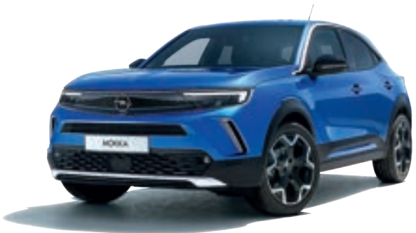
Voltaic Blue* Metallic paint*