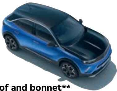
Black roof and bonnet**