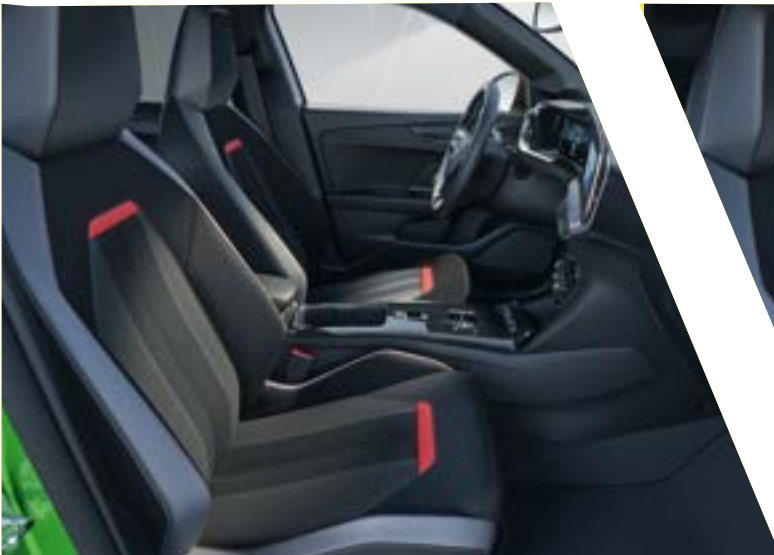
MOKKA SRi Black leatherette & cloth with red stitching Silver dashboard trim*