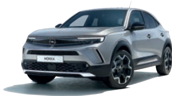
Quartz Grey* Metallic paint*