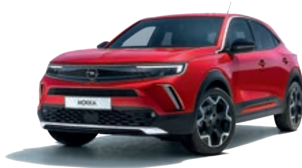
Power Red* Metallic paint*